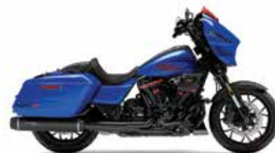
CVO™ STREET GLIDE™ ST