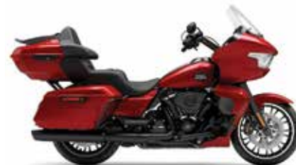
ROAD GLIDE™ LIMITED