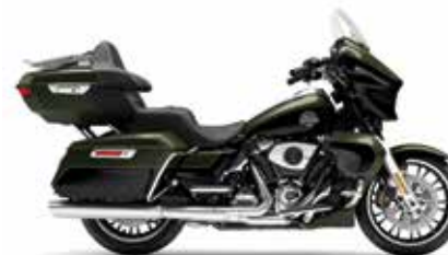
STREET GLIDE™ LIMITED