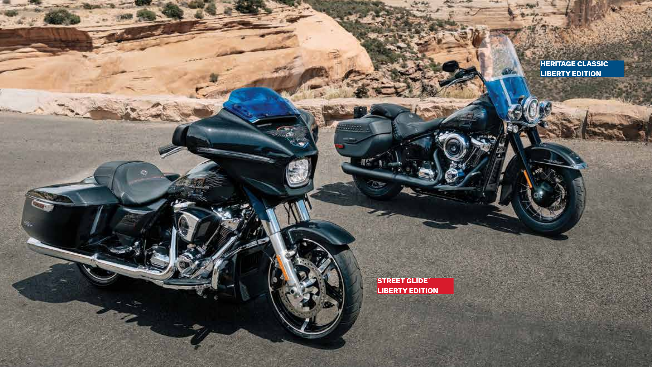
HERITAGE CLASSIC LIBERTY EDITION