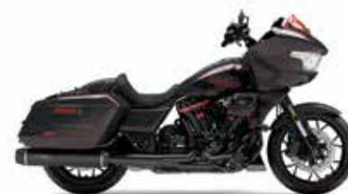
CVO™ ROAD GLIDE™ ST