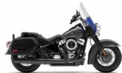
HERITAGE CLASSIC LIBERTY EDITION