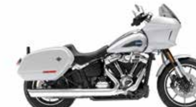
LOW RIDER™ ST