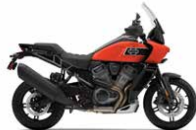
PAN AMERICA™ 1250 SPECIAL