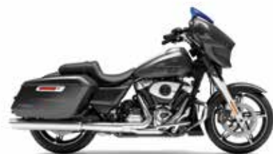
STREET GLIDE™ LIBERTY EDITION