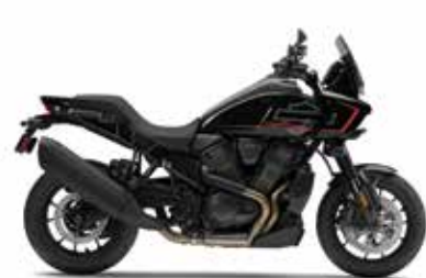
PAN AMERICA™ 1250 ST