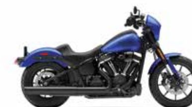
LOW RIDER™ S